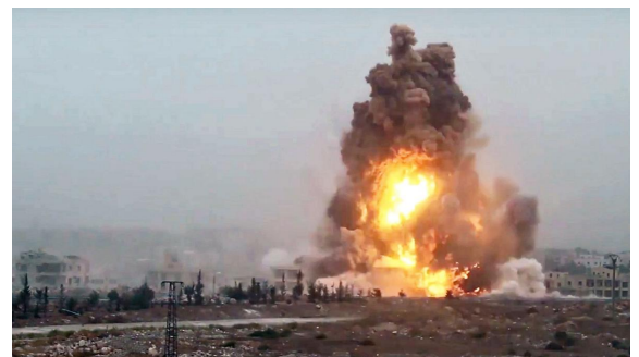
This image depicts the battle of Aleppo