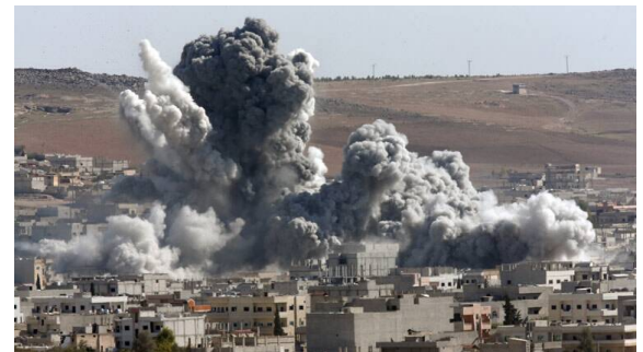
This picture depicts airstrikes against the Islamic State in Syria.

Since 1970, when Hafez al-Assad seized control of Syria and centralized power in the presidency, there has been widespread dissatisfaction throughout the country. 1 This is because Assad led an autocratic regime, which distributed shares of political patronage to people, and used the military to suppress uprisings with brute force. 1 This was demonstrated in Assad's response to a Muslim Brotherhood uprising in the city of Hama, where more than twenty-five thousand were killed. The dissatisfaction that resulted from this turned to protests, which were brutally suppressed. The military conducted mass arrests, sieged cities using tanks, and killed unarmed protestors. This occurred in multiple cities across Syria, with the first one being Deraa. Soon after, opponents of the regime began to arm themselves, and the protests turned to civil war in 2011.