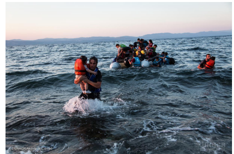
This image shows refugees from Syria

organization by Turkey and the U.S. 1 In 2019, the U.S. sided with Turkey over the YPG, and removed its troops from the Turkish border, allowing Turkey to launch a military offensive against the Kurds. 1 Turkey also deployed their military in 2016 to block the Kurds from linking their two cantons in a contiguous territory. 1 According to the Council on Foreign Relations, Turkish troops and their Syrian rebel allies seized towns and villages in 2019 after U.S. troops were removed, resulting in the SDF turning to the Syrian government for help. 1 Due to the Syrian Civil War, millions of people are displaced or fleeing, and neighboring countries are forced to host them. According to the Council on Foreign Relations, Lebanon is hosting more than a million Syrians, Jordan has over half a million, and Turkey hosts over three million. 1 The CFR states that this strains government resources, and that the millions of refugees journeying to Europe are contributing the largest migrant and refugee crisis since World War 2. 1 The CFR also states that there has been disputes over how to settle refugees across the EU. In 2016, the economically valuable city of Aleppo had been captured by the regime, a city which had been contested since 2012. 1 This defeat for the rebels had isolated them in northern Idlib, parts of