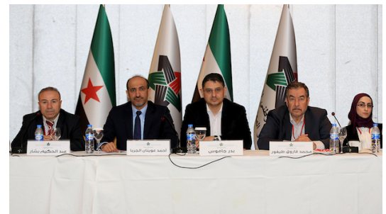
This image depicts the SNC, or Syrian National Coalition.

The Syrian Civil war is between the Assad government and the rebels that oppose it, with both sides backed by different foreign powers. The rebels are backed by Turkey, Saudi Arabia, and the U.S., while the government is backed by Russia and Iran. 2 In addition to these groups, the Islamic State and Al-Qaeda were also involved in the Syrian civil war. Al-Qaeda wanted to capitalize on the chaos in Syria, and they called for Sunni's in the region to join a jihad against the Assad regime in 2012. 1 After this, the Islamic state emerged in 2013, and seized control of territory in Syria. 2 In 2015, the Islamic State coordinated terrorist attacks across Europe, and in response, the U.S., UK, France, Saudi Arabia, Turkey, and others expanded their air campaign to include Syria. 2 Following this, over eleven thousand airstrikes have been conducted against the Islamic State in Syria by these countries. 2 This topic is greatly important, due to the millions of internally displaced people and refugees. According to UN reports, more than 5.6 million people have fled the country and more than 6 million have been internally displaced. 2 In addition to this, immense amounts of people have been killed, estimates are around 400,000 since the start of the war. 2